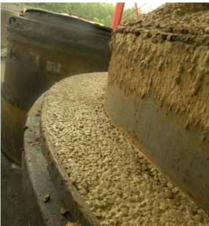
Comparison of Portland Cement Concrete & ekkomaxx 300™ Cement Concrete Compressive Strength Loss Through 84 Days Sulfuric Acid Immersion